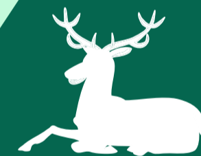
The lodged hart of Hertfordshire and the town of Harpenden