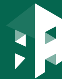
The home-themed letterform icon of our former logo